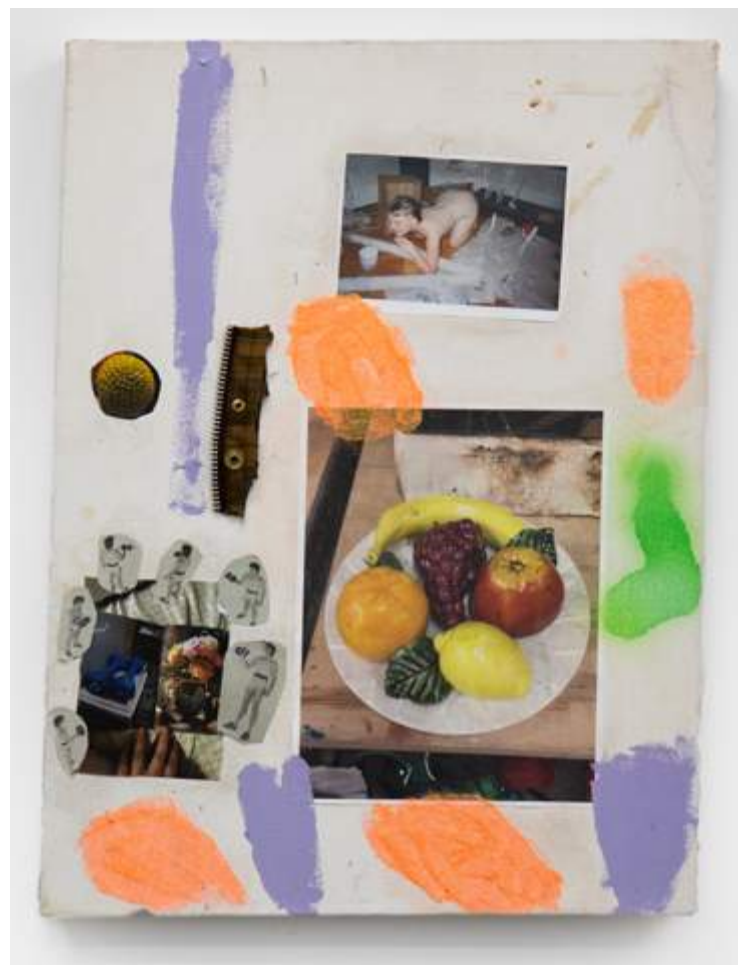
Hannah Beerman lickity split 2022 Acrylic, photo collage, and jacket zipper on canvas 61x45.7cm (24x18 inches) Ref. CR-HB01