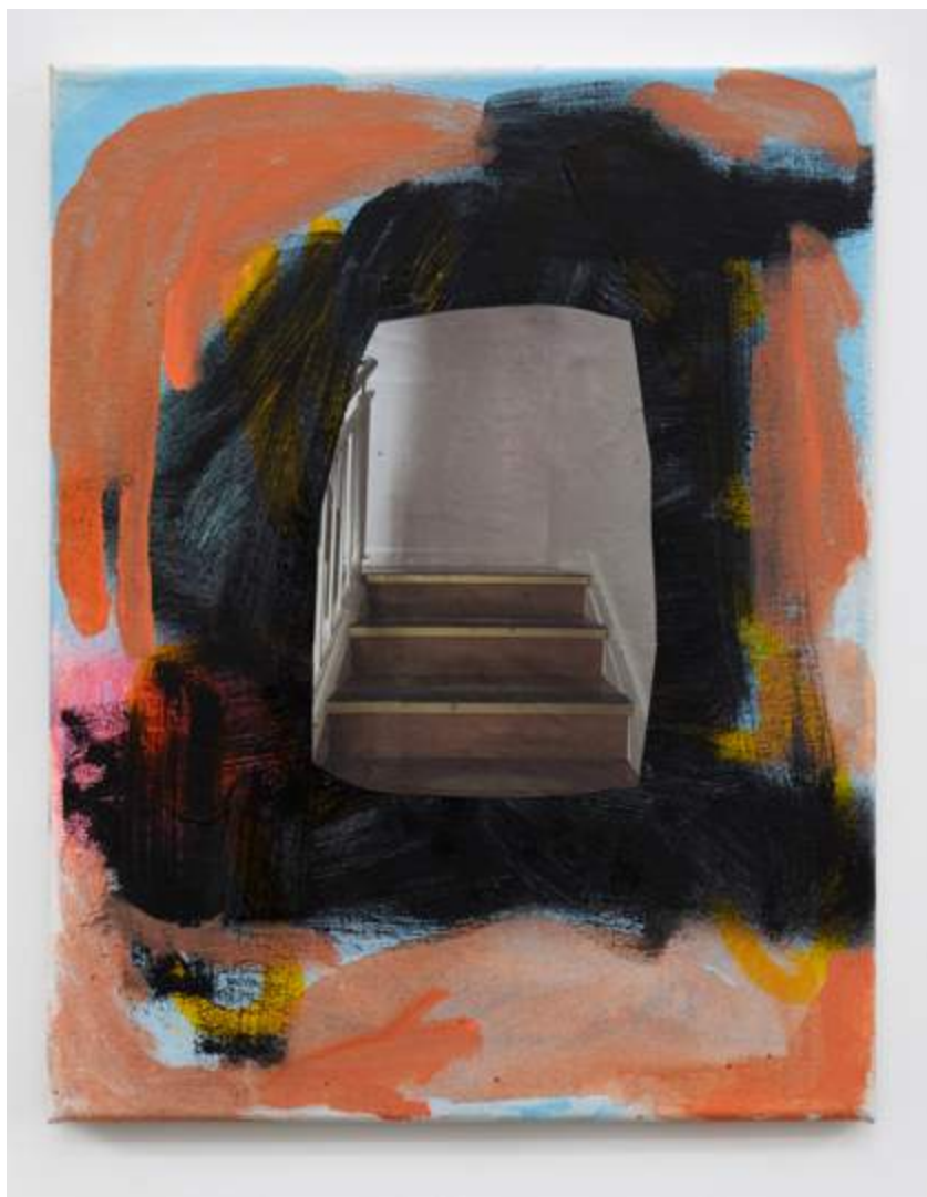
Hannah Beerman Good things come in threes 2022 Acrylic, collage on canvas 35.5x27.9cm (14x11 inches) Ref. CR-HB08