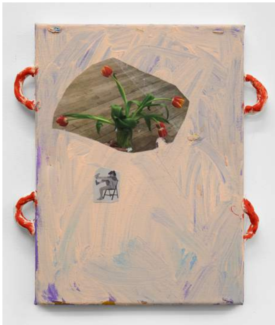
Hannah Beerman Handlebars 2022 Acrylic, collage and modelling compound canvas 30.5x26.7cm (12x10.5 inches) Ref.CR-HB12