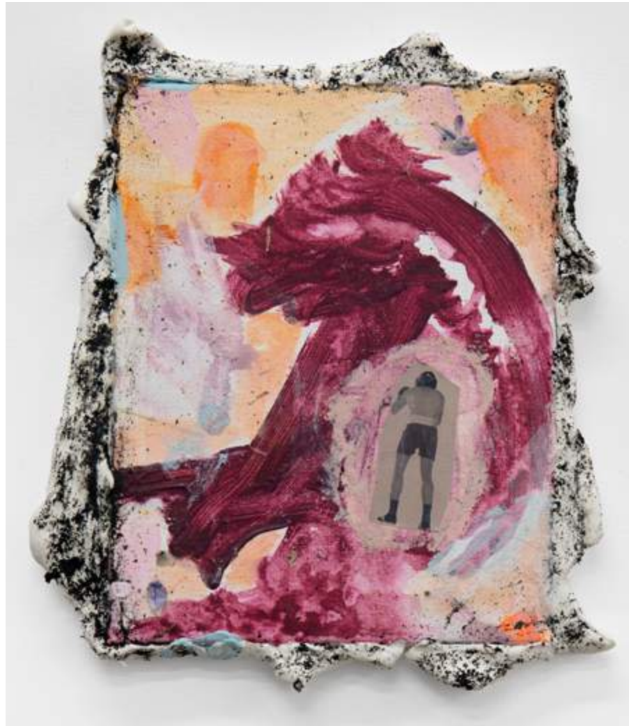
Hannah Beerman Something soft and only a little unreasonable 2022 Acrylic, collage, flower petals, shredded tires, and modelling compound on canvas 30.48x27.94cm (12x11 inches) Ref. CR-HB11