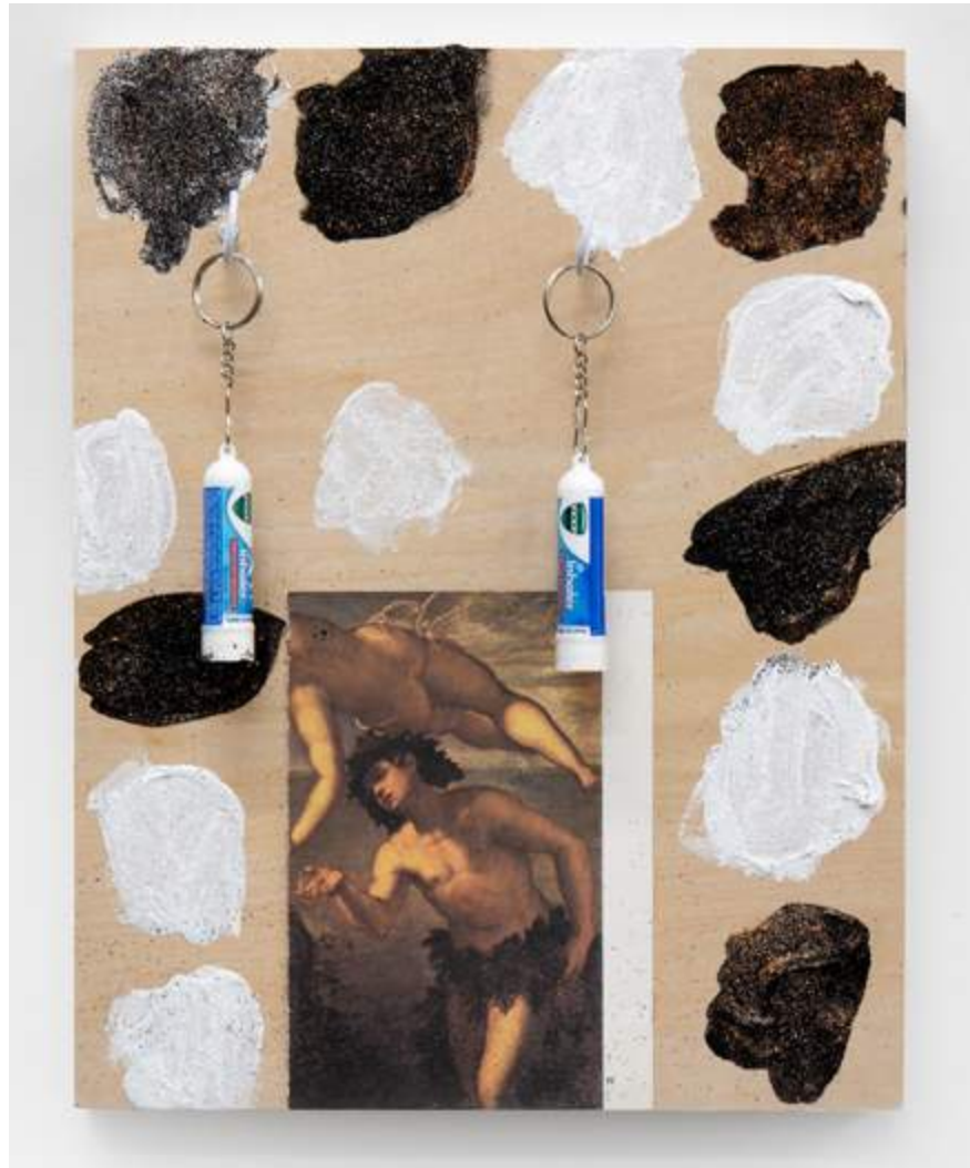
Hannah Beerman Grid #2 2022 Acrylic, glitter, Vics inhalers, metal, collage, Tintoretto reproduction 35.5x27.9cm (14x11 inches) Ref. CR-HB03