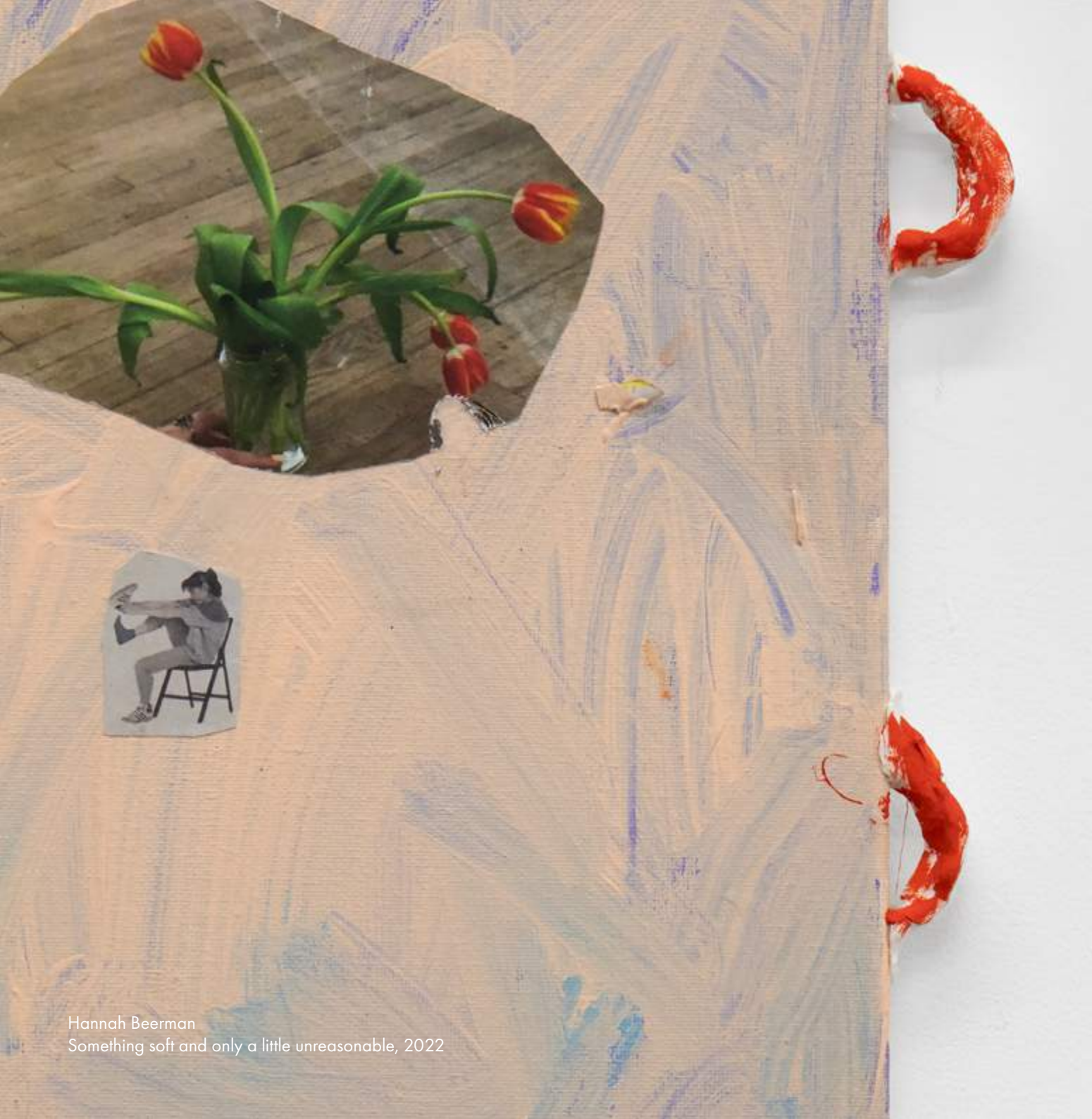
Hannah Beerman Something soft and only a little unreasonable, 2022

11) Hannah Beerman Something soft and only a little unreasonable 2022 Acrylic, collage, flower petals, shredded tires, and modelling compound on canvas 30.48x27.94cm (12x11 inches) Ref. CR-HB 11