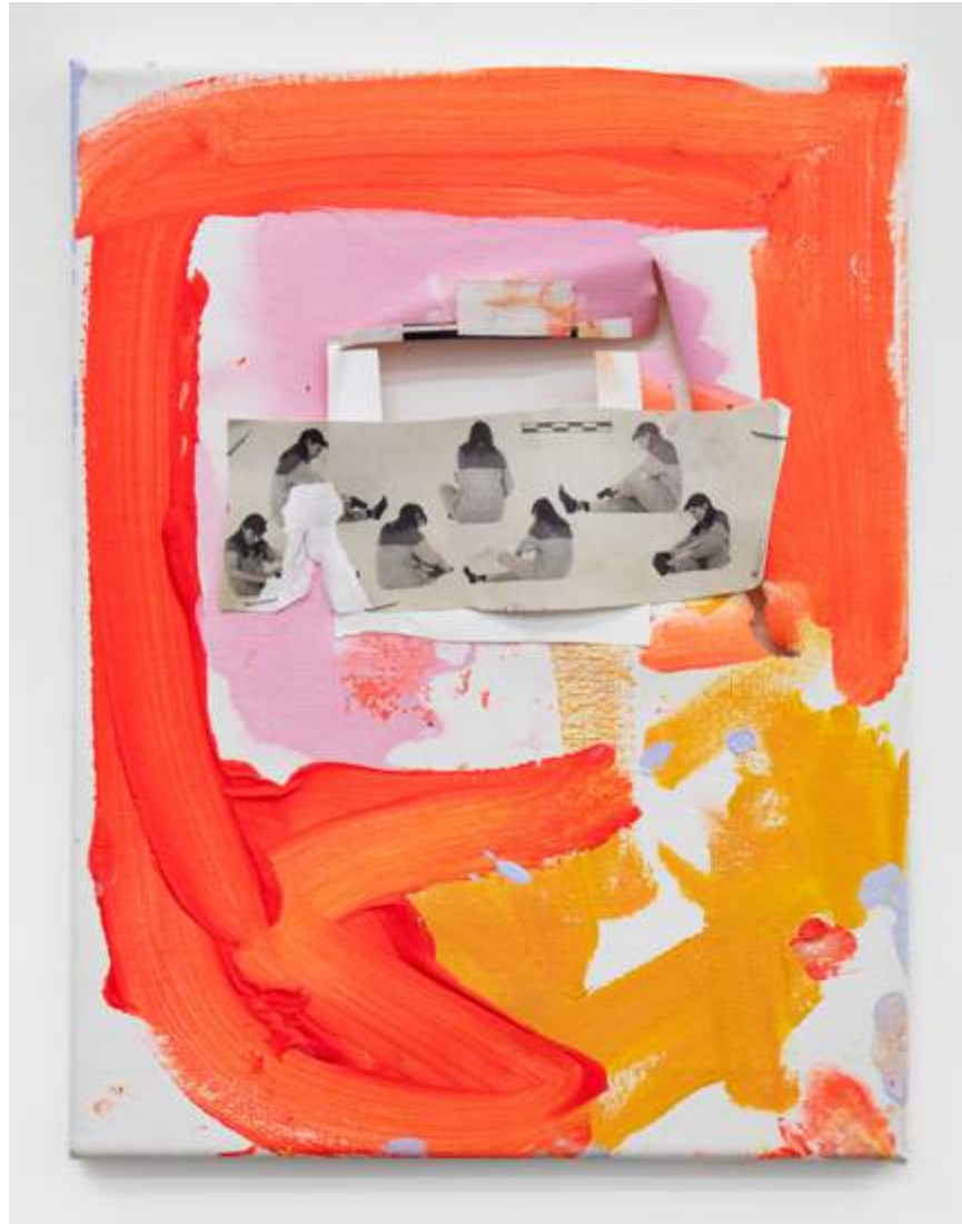
Hannah Beerman Patience and Peeping, Hieroglyphics in Blue 2022 Acrylic and collage on canvas 35.5x27.9cm (14x11 inches) Ref. CR-HB10