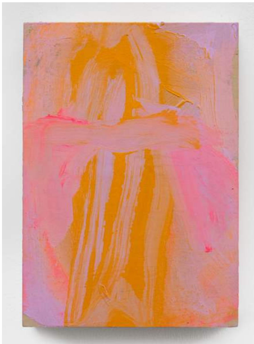
Hannah Beerman little life 2022 Acrylic on board 12.7x17.8cm (5x7 inches) Ref. CR-HB 16