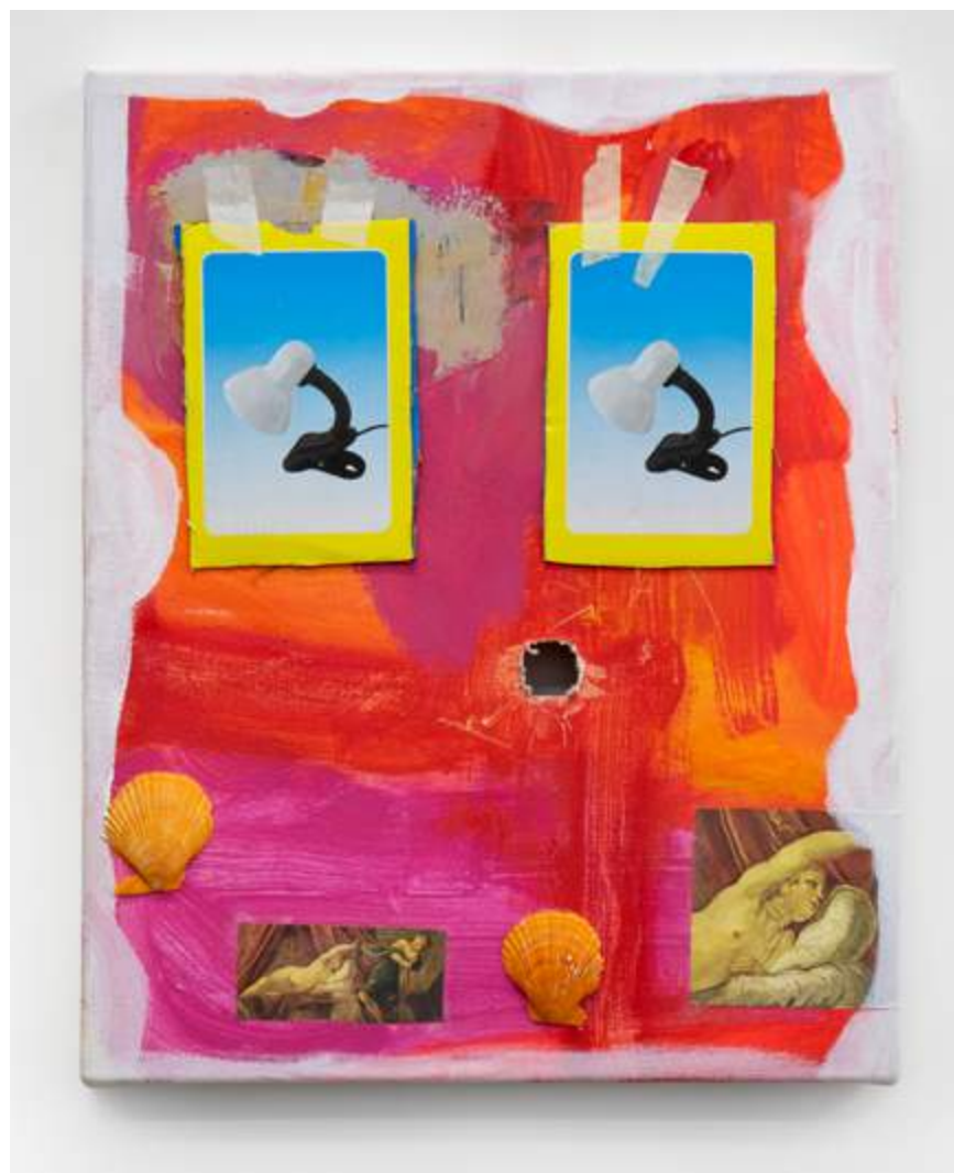
Hannah Beerman Call me if you get lost 2022 Acrylic, collage, seashells, gauche, on gessoed canvas 50.8x40.6cm (20x16 inches) Ref. CR-HB02