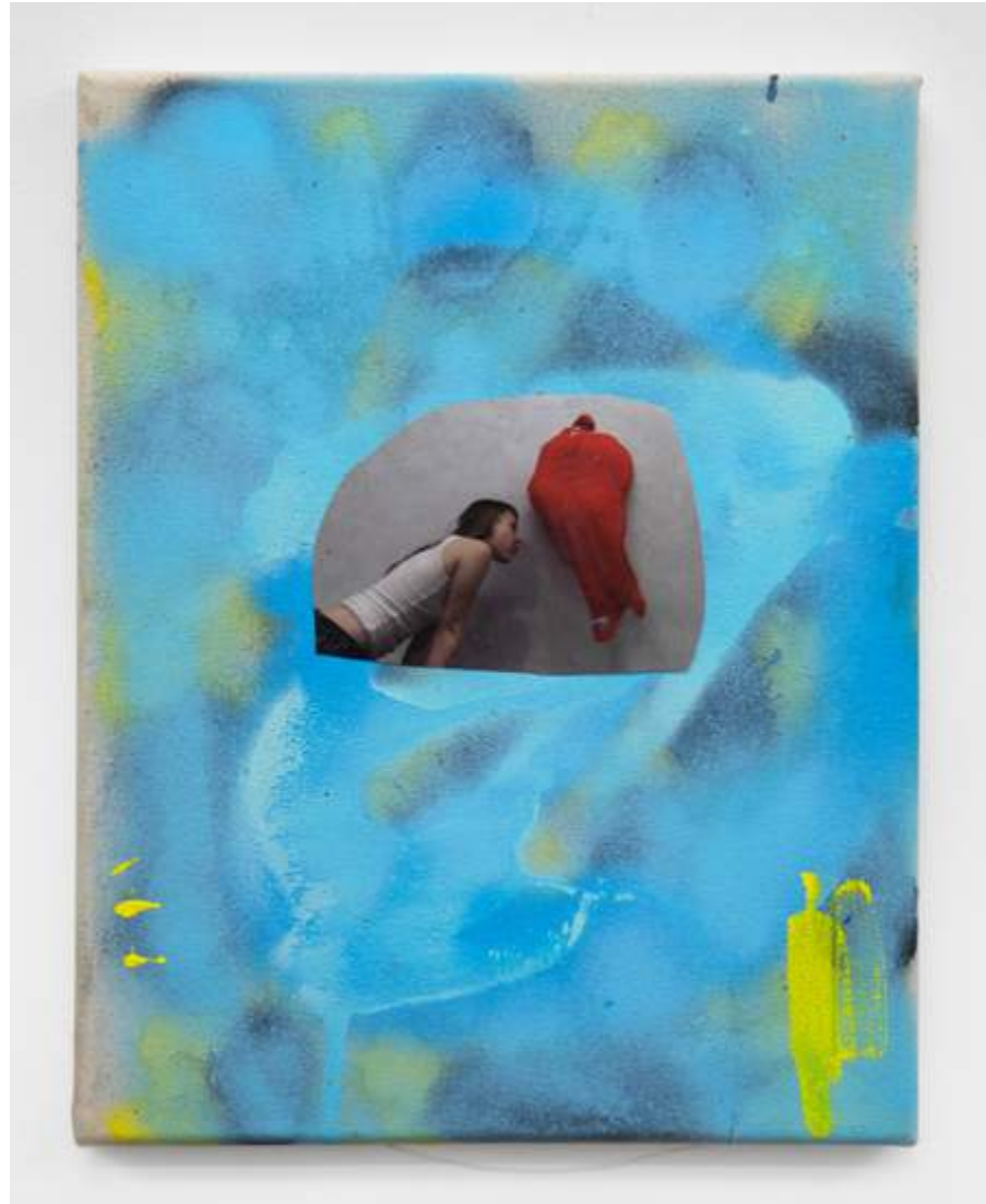
Hannah Beerman And Blow 2021 Acrylic and collage on canvas 35.5x27.9cm (14x11 inches) Ref. CR-HB09